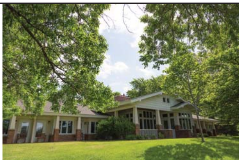
Crescent Cove — respite and hospice home

Even as we faced Levi's approaching death, Crescent Cove was helping us cherish each precious moment while supporting our transition as a family.